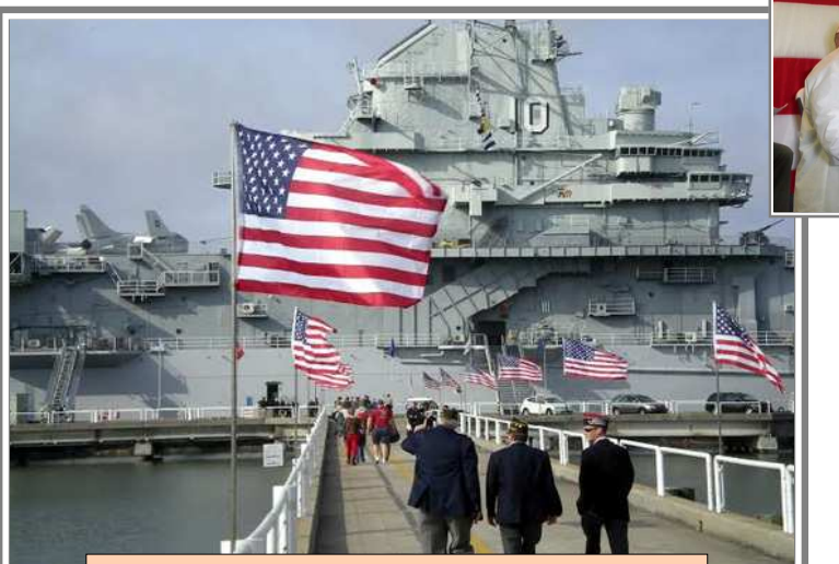
Guests boarding the U.S.S. Yorktown for the Pearl Harbor Remembrance Day Memorial Service