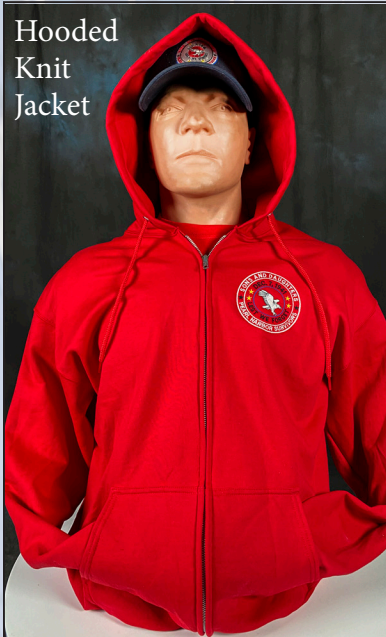
Hooded Knit Jacket