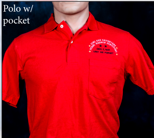
Polo w/ pocket