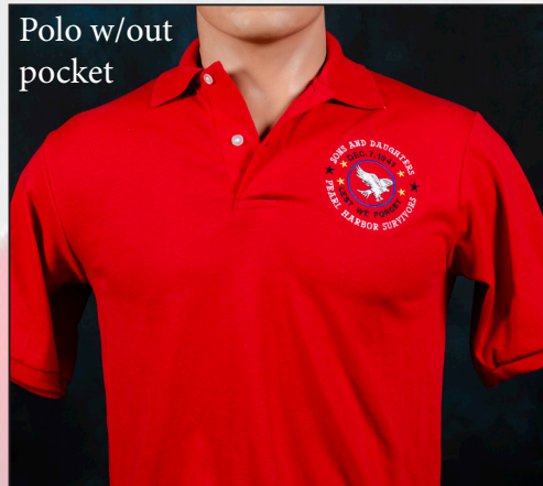
Polo w/out pocket