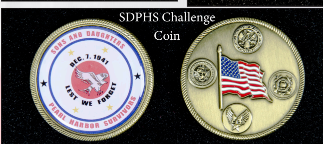
SDPHS Challenge Coin