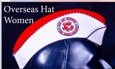
Overseas Hat Women