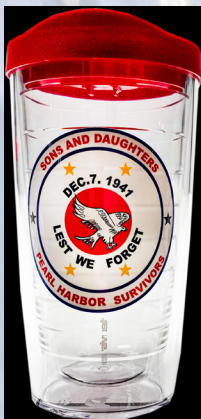
The Tervis 16 oz Tumbler.